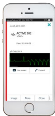
A waveform snapshot of the patient event helps prioritize a response on the spot.