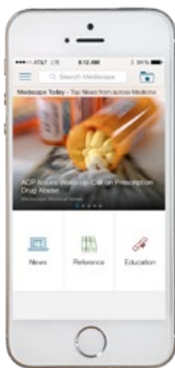
Surveys show that health-care clinicians use their personal devices for work related purposes like accessing drug reference apps. 1

Unite Messaging Suite delivers two-way, interactive messaging to smart devices for patient alert notifications with automatic escalation based on specific patient events and a pre-defined escalation chain. Unite provides secondary alarm notification with primary notification being the patient monitor system. Unite can also provide critical patient information along with an alert message to help clinicians speed up decision-making and prioritization. Staying connected to a patient even when you are not in their room is easily accomplished with a smart device and Ascom middleware integration.