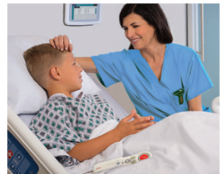
Nurse Rounding Recognition