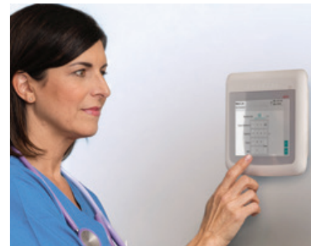
Quick Charting via Ascom TelliConnect Station

The Ascom Healthcare Platform solutions are designed to integrate, orchestrate and enable aligned end-to-end digital clinical information and workflows between systems, people and devices at virtually any point of care. Representing applications, services, devices and smartphones, the Platform and Ascom Telligence enable seamless access, sharing and tracking of information across clinical teams.