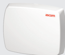
Passive bus concentrator (PBC) – NUPBC-H

These control devices are used as elements within the Ascom Telligence Patient Response System. Contact us today to learn more about the features and benefits of Ascom Telligence.